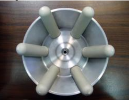
Figure 2. Bottom of angle rotor