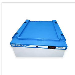
Labcold Stacking Kit