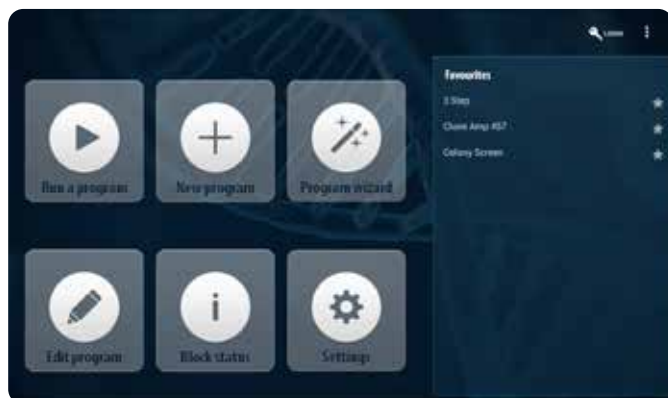
Program Interface Home Screen

All PCR-300 Alpha Cyclers are driven by the same software allowing for simple use and transition between instruments for both users and protocols. The intuitive Android interface makes the system easy to use with minimal to no training. The home screen below highlights the clear and simple to follow nature of the PCR-300 software.