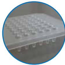
Convenient 48-well format meets the throughput needs of most researchers