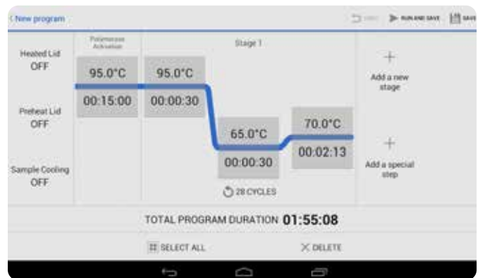
Live Progress view

Program Wizard also allows for high-specificity touch-down PCR and will accommodate for GC/AT imbalances in the target sequence to produce optimal Tms and hold times.