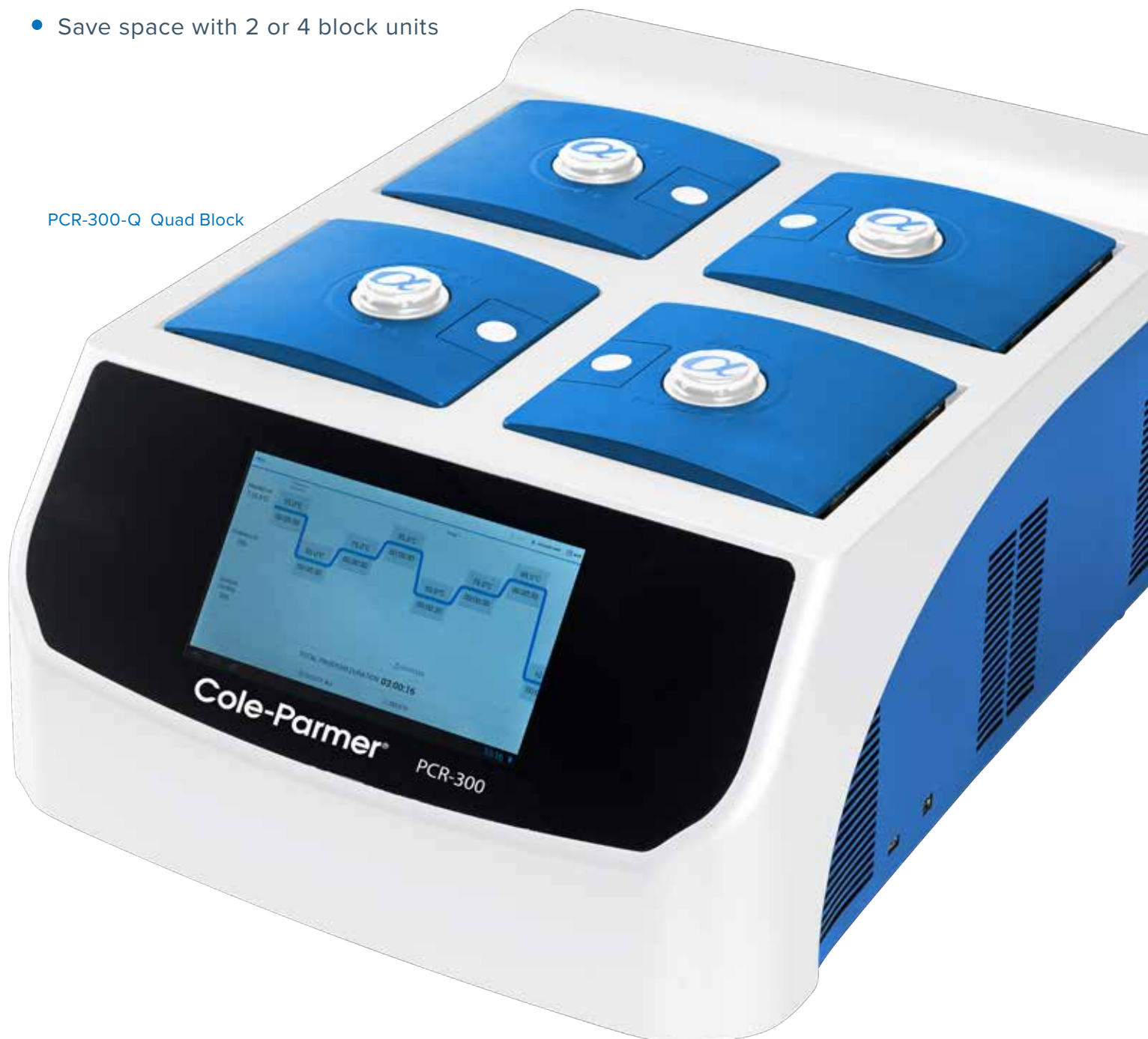
PCR-300-Q Quad Block