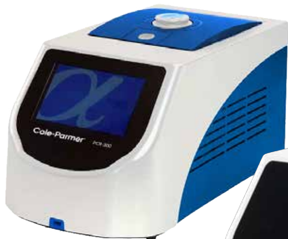
PCR-300-S Single Block

The Cole-Parmer PCR-300 Alpha Cyclers are developed to deliver not only the best quality data you can expect from a thermal cycler but also to innovate and exceed the high standards expected by the community. With options of either one, two or four independently controllable blocks, the PCR-300 is a platform which scales to the throughput of the laboratory. With programs easily transferable between any PCR-300 instrument and user specific defaults stored on the user's USB login device (any USB drive can be programmed as a login device) there are no issues with transferring work between systems or collaborating/sharing across multiple sites.