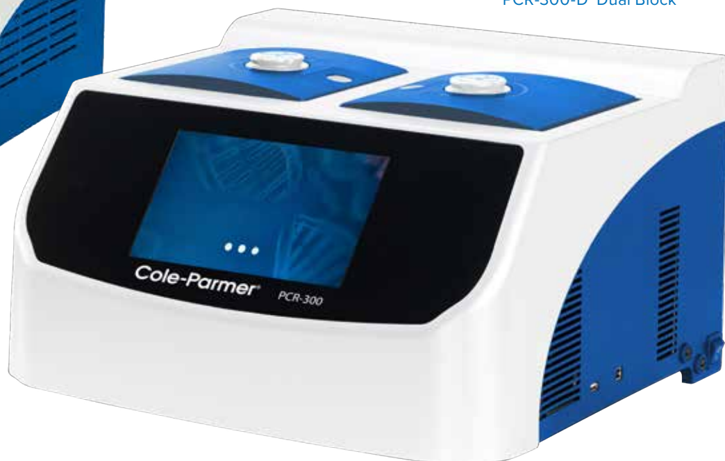
PCR-300-D Dual Block