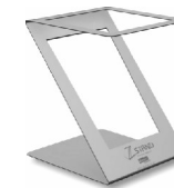
Z Stand for 6 Litre Bio-bin®