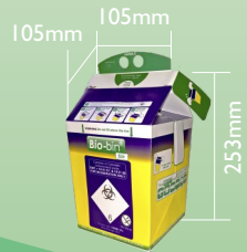
Bio-bin® 1 Ltr 1 Litre Max fill weight 0.5kg Case Size: 100 bins