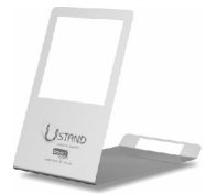
U Stand for 6 Litre Bio-bin®