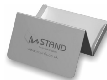
M Stand for 2 & 5 Litre Bio-bin®