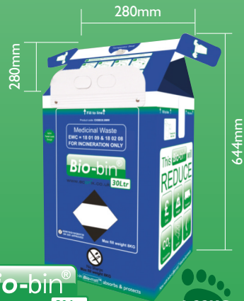
Bio-bin® 30 Ltr 30 Litre Max fill weight 8kg Case Size: 10 bins 1.22KG CO2

ALL OUTER CASES MADE FROM 100% RECYCLED MATERIAL