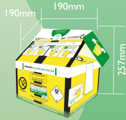
Bio-bin® 2 Ltr 2 Litre Max fill weight 1kg Case Size: 100 bins