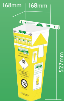
Bio-bin® 6 Ltr 6 Litre Max fill weight 1kg Case Size: 40 bins 0.19KG CO2