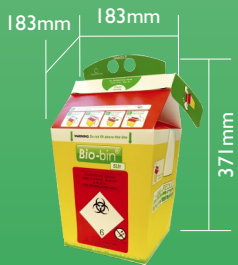
Bio-bin® 5 Ltr 5 Litre Max fill weight 2kg Case Size: 100 bins 0.18KG CO2