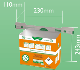
Bio-bin® Loop Loop Max fill weight 2kg Case Size: 100 bins