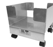
Wheeled Floor Stand for 30 Litre Bio-bin®