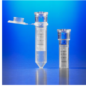
Spin-X UF 500