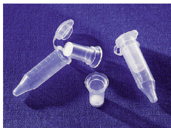
Corning Spin-X Centrifuge Tube Filters

Spin-X centrifuge tube filters consist of a membrane-containing (either cellulose acetate or nylon) filter unit within a polypropylene centrifuge tube. They filter small sample volumes by centrifugation for bacteria removal, particle removal, HPLC sample preparation, removal of cells from media and purification of DNA from agarose and polyacrylamide gels. (See Corning Technical Bulletin: Spin-X purification of DNA from agarose gels, page 6.)