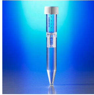
Spin-X UF 6