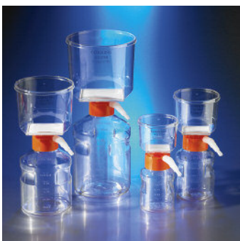
Corning Filter/Storage Systems

Corning filter/storage systems consist of a polystyrene filter funnel joined by an adapter ring to a removable polystyrene storage bottle with a separate sterile polyethylene cap. Receiver bottles feature easy grip sides for improved handling. Additional Corning polystyrene receiver/storage bottles can be ordered separately to increase throughput.