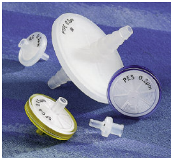
Corning Syringe Filters

The smaller conventional Corning® syringe disc-type filters (4, 15, and 25, 26 and 28 mm diameter) are used with syringes which serves as both the fluid reservoir and the pressure source. They are 100% integrity tested. The HPLC-certified non-sterile syringe filters are available with nylon, regenerated cellulose or Teflon® (PTFE) membranes in polypropylene housing for extra chemical resistance. The sterile tissue culture tested syringe filters are available in PES, regenerated cellulose (ideal for use with DMSO-containing solutions), or surfactant-free cellulose acetate membranes in either polypropylene or acrylic copolymer housings.