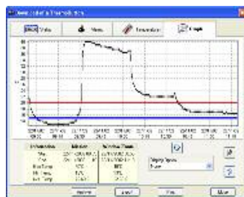
Data logging software